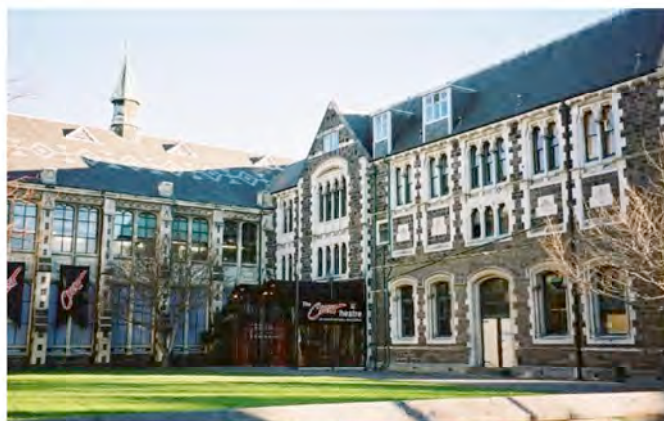
Hydraulics lab(right) engineering extension(left)