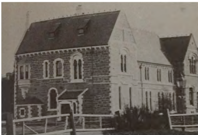
Mechanical engineering before the hydraulics lab was built.