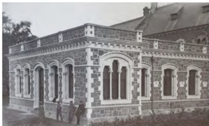
Hydraulics Lab (1906)

central funding to help with building costs. However, the new building, which housed an electrical machines lab on the ground floor with drawing and design offices above, was not completed until 1923, after Scott's retirement in 1922, on account of ill-health. His legacy was not only a highly successful engineering school, but also the largest group of buildings devoted to a single department on the college campus.