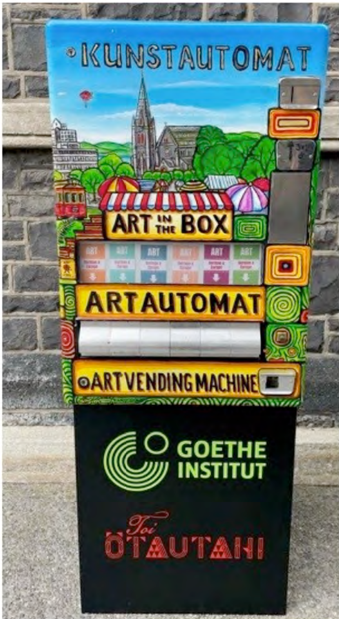
Kunstautomat: South Quad