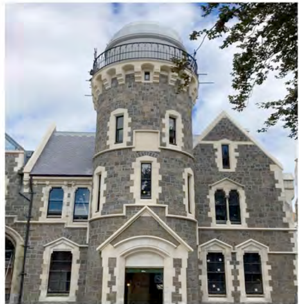
Former Biology Laboratories and Townsend Observatory

Don't forget to keep an eye on what is happening in the various exhibition spaces at the Arts Centre. In addition to the Centre Gallery and the gallery spaces in the Old Boys' High building, it is sometimes easy to overlook the Physics Room on the ground floor of the New Registry building. If you have an interest in contemporary art but you haven't yet discovered this space you should keep an eye on what is happening here.