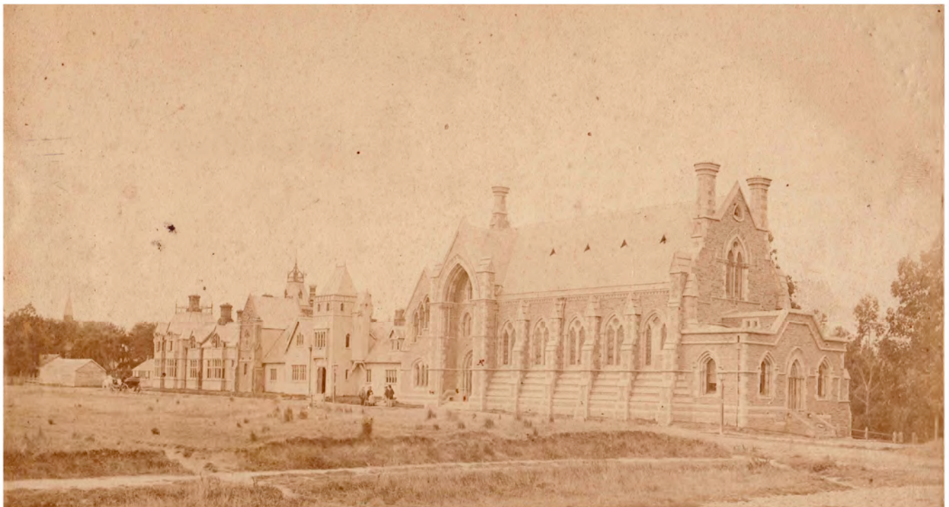
Canterbury Provincial Council Buildings Circa 1865.