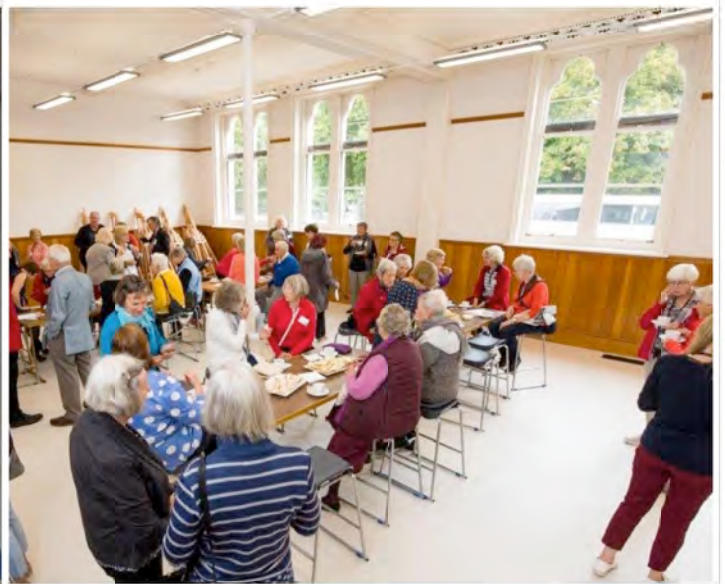
Invited guests enjoying some hospitality in the art workshop space, ground floor