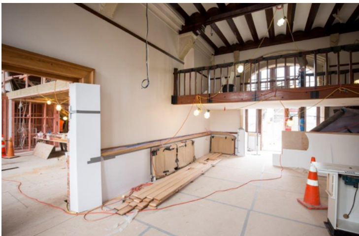
Clock Tower restoration