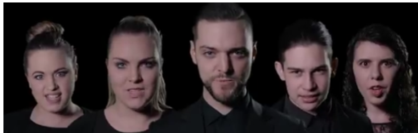
Voices Co – Winning Medley – The Naked Choir 2017

After their success on TVNZ's The Naked Choir we are delighted to present Voices Co. who will perform a special Arts Centre fundraising concert in the stunning Great Hall.