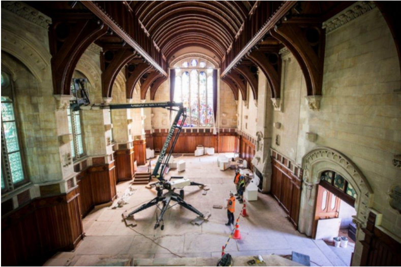
Great Hall restoration.

The Arts Centre's restoration has received two significant heritage awards, bringing its post-earthquake award tally to five. Awards were received from the prestigious UNESCO Asia-Pacific Awards for Cultural Heritage Conservation and from the New Zealand Institute of Architects. In addition, Holmes Consulting's work on the restoration made the shortlist of the "Oscars of structural Engineering" – the Institution of Structural Engineers' 2017 Structural Awards. The recognition relates to the post-earthquake restoration of two of the Arts Centre's most historically valuable buildings – the Great Hall and Clock Tower.