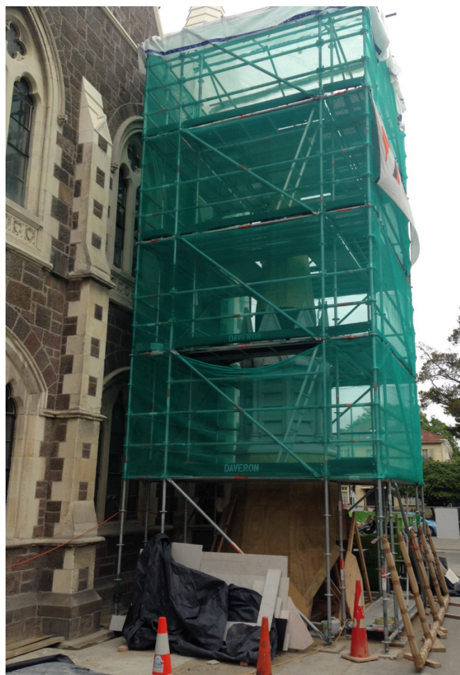
The outline of the flèche can be seen behind the green safety covering..