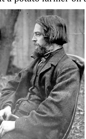
Benjamin Mountfort (1825 – 1898) Initial Arts Centre architect.

Here music flowed, artists bloomed, sculptors carved, orators honed their voice, actors declaimed inside and out, dancers moved, writers penned, many crafts displayed their wares and so added to the life of the city.