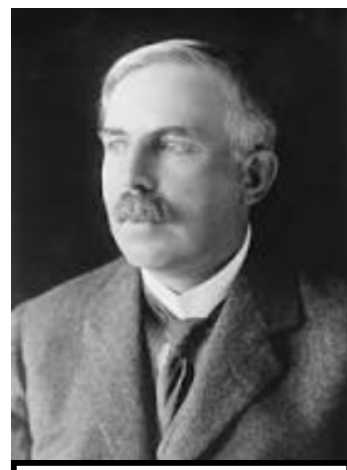
Lord Rutherford (1871 – 1937) Referred to as the father of nuclear physics.

This site from its first occupation has been set up to nurture, promote and send out individuals and groups to shape the life of the city, province, country and the world at large. It sent a potato farmer on a