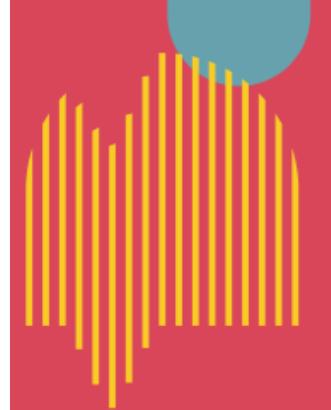
The Great Hall Lunchtime Concert series is brought to you by the Arts Centre and the Concerts for Christchurch Foundation Trust.

Get tickets at the Great Hall door from midday on the day of the concert.